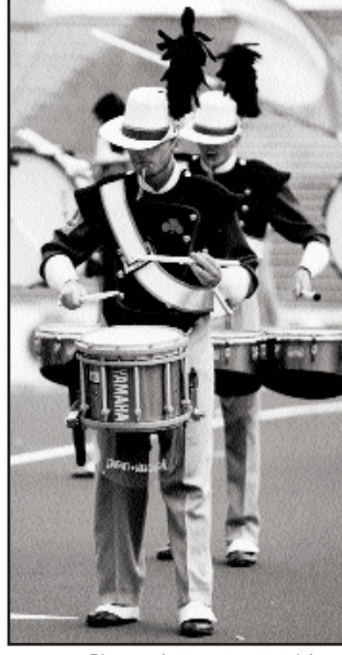
Pioneer, August 13, 1999 (photo by David Rice from the collection of Drum Corps World).