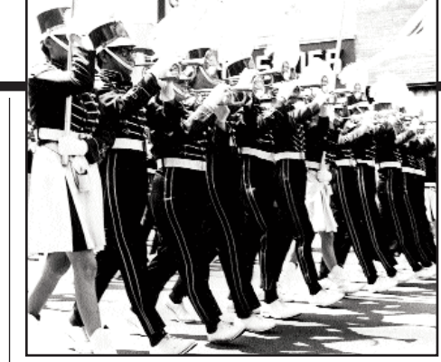
Imperials of St. Patrick, 1968.